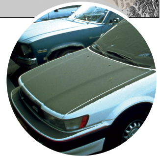
Inset photo. Ashfall on vehicle in Anchorage from Crater Peak eruption, August 18, 1992.