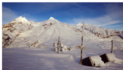
Typical monitoring station with Crater Peak and Mount Spurr in the background.

Mount Spurr is one of the best monitored volcanoes in Alaska and has a network of instruments that send data in real time to AVO. Staff use satellite, seismic, deformation, and infrasound data to assess activity levels at all active volcanoes in Alaska, including Mount Spurr. Detailed records of eruptions, pilot reports, and monitoring data help AVO staff provide information before, during, and after a volcanic event.