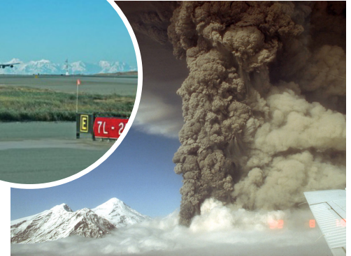
Column of ash rising from Crater Peak during the eruption on August 18, 1992. Inset photo. Anchorage International airport is 80 miles from Mount Spurr, visible here behind a landing airplane.

Administration (FAA) and the National Weather Service (NWS), who issue warnings about airborne volcanic ash to pilots.